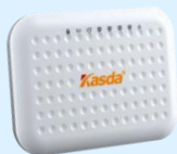
KW58293 ADSL2+ Modem Router

Internal 2T2R 1* DSL port 4 *Fast LAN port 300Mbps Wi-Fi Speed