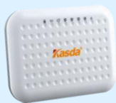
KW58293 ADSL2+ Modem Router

Internal 2T2R 1* DSL port 4 *Fast LAN port 300Mbps Wi-Fi Speed