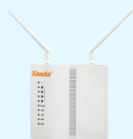
KW5262B VDSL VoIP Gateway

External 2T2R 1 *USB2.0 1 *DSL RJ-11 port 2 *FXS ports 4 *Fast LAN ports 300Mbps Wi-Fi Speed